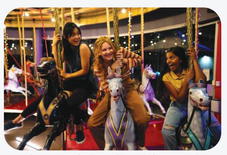
Winner of International Emmy Kids Award, Kidscreen Award, Banff World Media Festival Rockie Awards and runner up NHK Japan Prize.

Fun and fast paced, we challenge modern kids to walk in the shoes of a child from another era. Each episode is built around a fresh and exciting story you won't find in the history books! The series explores ten incredible tales of children's exploits from the past. But while visiting familiar eras and events, each episode looks at them from a brand new historical viewpoint: through the eyes of the children who were there. Diving into new worlds, they learn as much about themselves as they do about history... and unearth some unexpected skills in the process!