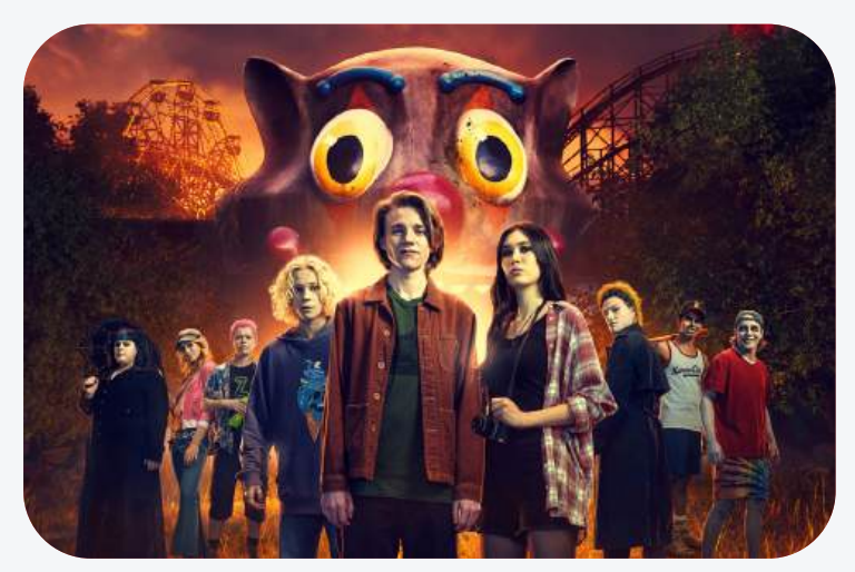
Winner of Logie Award.