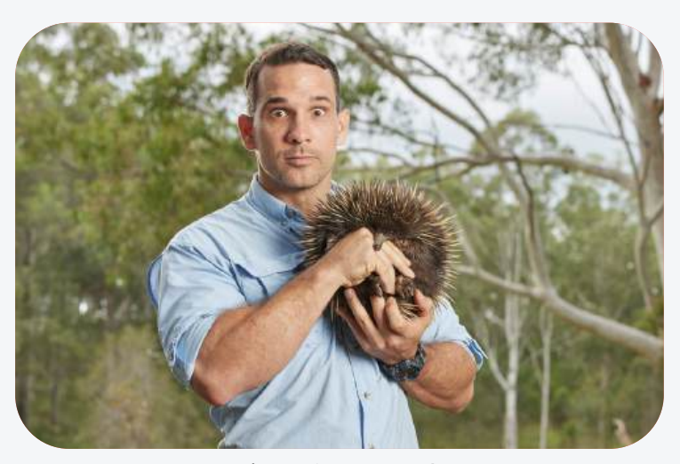
Winner of Emmy Award.