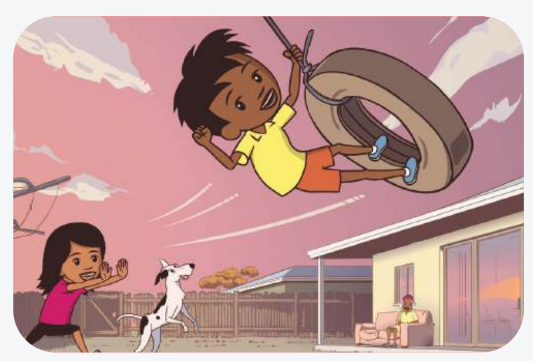
Winner of Logie Award, Prix Jeunesse Finalist, NHK Japan Prize Runner Up.

Every dazzling day is an action-packed adventure for the four furry friends, whether training to be lifeguards, mastering new water sports, discovering the marvels of the ocean, or scuba diving for underwater treasure. With waves to surf, a coral reef to enjoy, fascinating sea creatures to meet and a tropical island to explore, they're never far from fun – or danger!