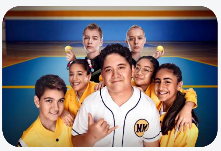
Winner of Prix Jeunesse, International Emmy Kids Award, NHK Japan Prize, Banff World Media Festival Rockie Awards.

Full of fun, action, humour and heart, filmed outside Katherine amid stunning outback scenery.