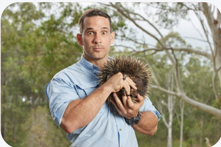
Winner of Emmy Award.