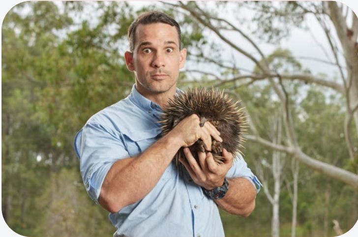
Winner of Emmy Award.