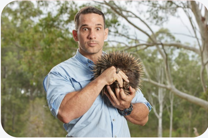
Winner of Emmy Award.