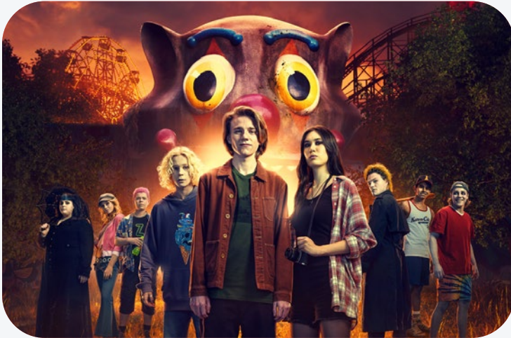
Winner of Logie Award.