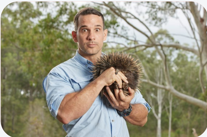
Winner of Emmy Award.