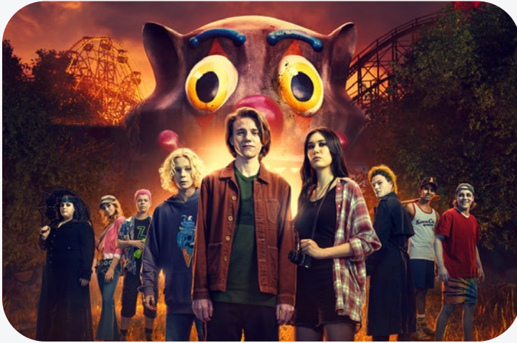
Winner of Logie Award.