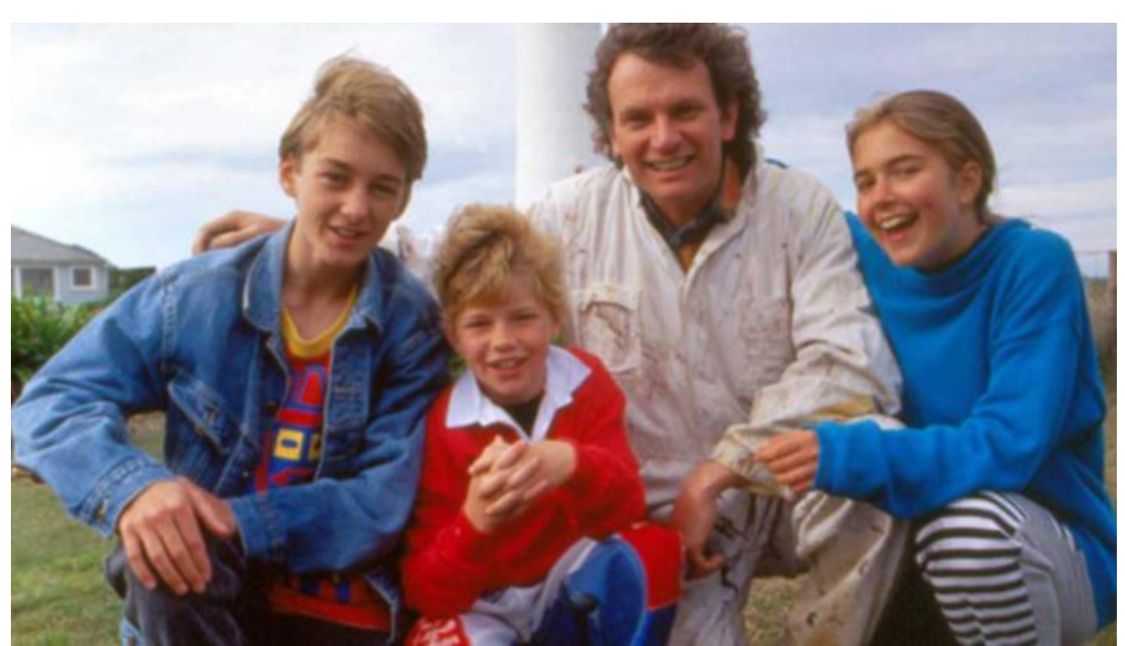
Round the Twist (4 series from 1989 – 2001)

This success story was made possible through the direct support of successive Commonwealth Governments and the establishment of a regulatory framework that targeted support for the creation of Australian children's content.