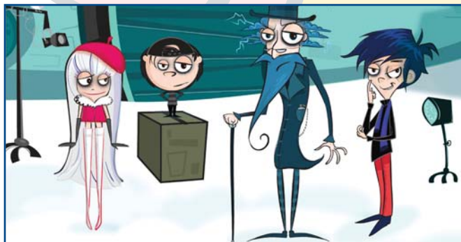
The Dream Factory