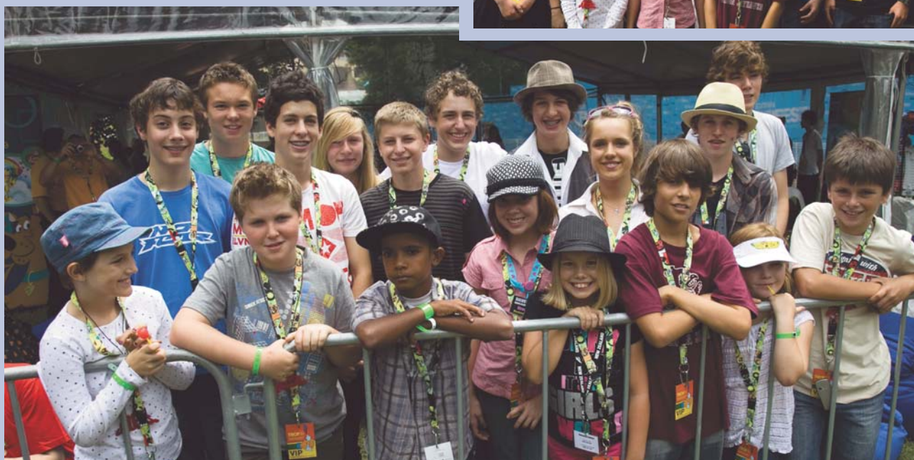
2009 Trop Jr finalists at The Domain in Sydney's Royal Botanic Gardens, in February.