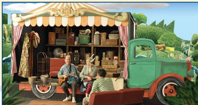
Big Green Truck

those such as stunt kid Howie who prefer nightmares over dreams (more action!) as well as the chance to get Tommy into trouble.